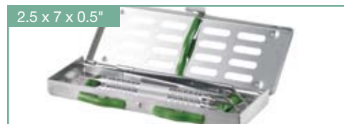
SysTM 1 2.5 x 7 x 0.5" (64 x 178 x 13 mm)

Select from four sizes, designed to fit the Statim 2000 and 5000.