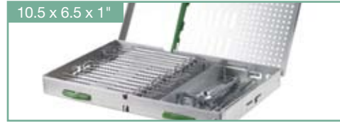
SysTM 4B 10.5 x 6.5 x 1" (267 x 165 x 25 mm)