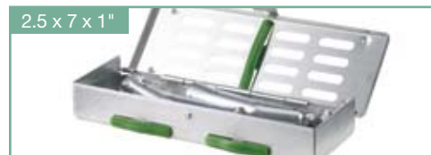
SysTM 2 2.5 x 7 x 1" (64 x 178 x 25 mm)