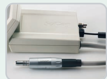
Compact design for easy installation