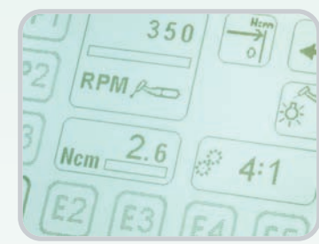
Accurate calculation of bur & file speed display